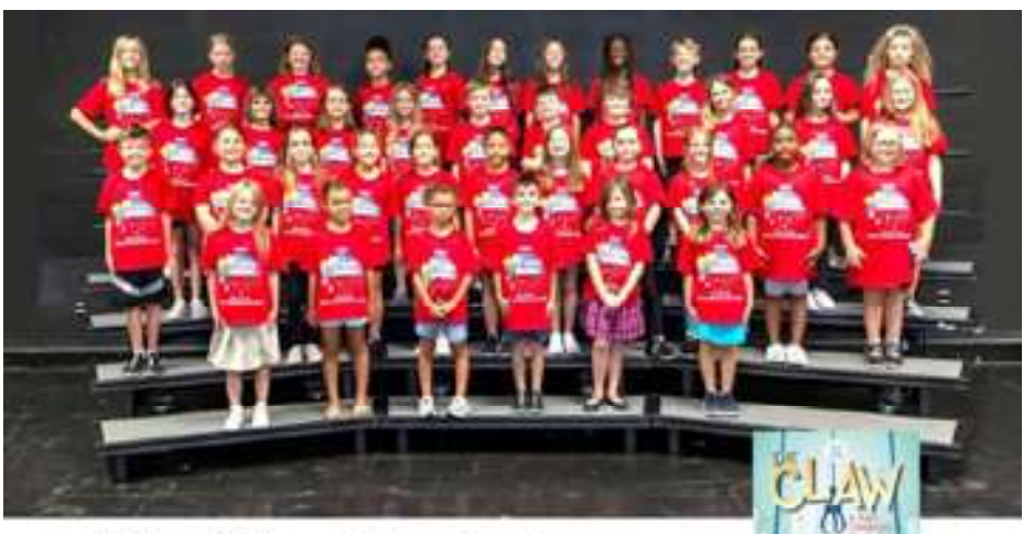
The Claw Musical - 2022