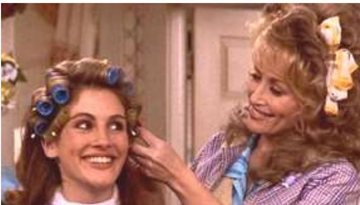
Julia Roberts , left, and Dolly Parton in the movie version of Steel Magnolias .

This multiple award-winning classic, set in a beauty salon in Chinquapin, LA, features wise-cracking salon owner Truvy, her eager new assistant Annelle, the town's rich curmudgeon, Ouiser, eccentric millionaire Clairee, local social leader M'Lynn and her daughter Shelby. Filled with hilarious repartee, the play is truly touching, as the women and their friends encounter tragedy and good fortune, growing stronger and closer in the process.