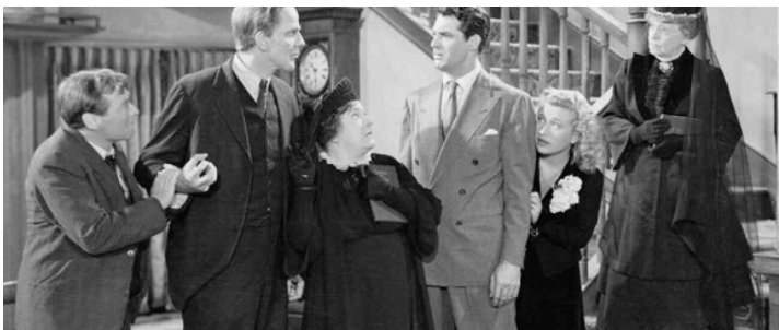
The 1944 film version of Arsenic and Old Lace , directed by Frank Capra, starred Cary Grant , third from right, as Mortimer Brewster with, from left, Raymond Massey as Jonathan, Josephine Hull as Abby Brewster, Priscilla Lane as Elaine Harper and Jean Adair as Martha Brewster.

A classic in American theater, this farcical black comedy revolves around the Brewster family. The family includes two spinster, sister aunts, who like to murder lonely old men who rent rooms from them and their two grown nephews Mortimer and Teddy. Mortimer is a successful, newly-wed writer and Teddy, who still resides in the house, a delusional sibling who thinks he is Teddy Roosevelt. The New York Times said the play was “so funny that none of us will ever forget it.”