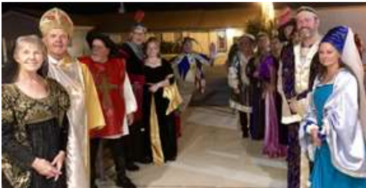
Lords and ladies prepare to bid the guests adieu at last year's Madrigal Dinner.