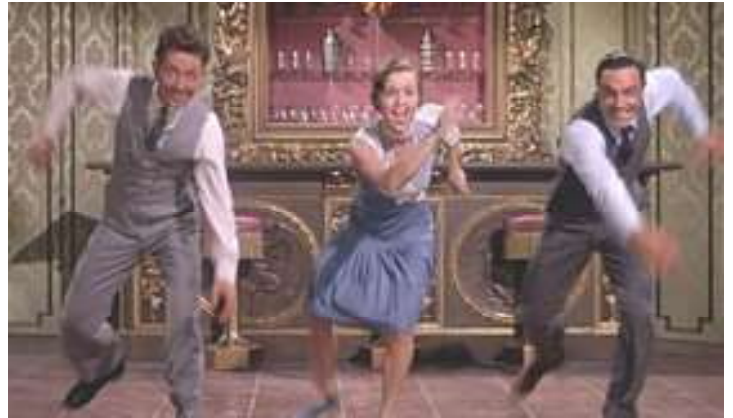
Teenager Debbie Reynolds keeping up with costars Donald O'Connell and Gene Kelly in the film version of Singin' in the Rain .

The “Greatest Movie Musical of All Time,” faithfully and lovingly adapted into a theatrical show, includes each unforgettable scene, song and dance, including the show-stopping title number. Hilarious situations, snappy dialogue and a hit-parade score of Hollywood standards make Singin' in the Rain the perfect entertainment.