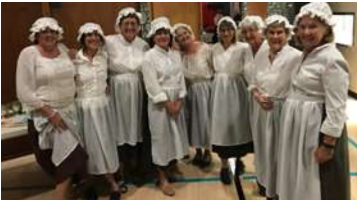
The serving wenches are ready with big smiles.