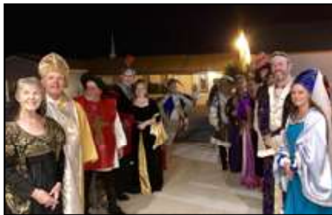
The head table and others prepare to bid the exiting audience "Merry Christmas."