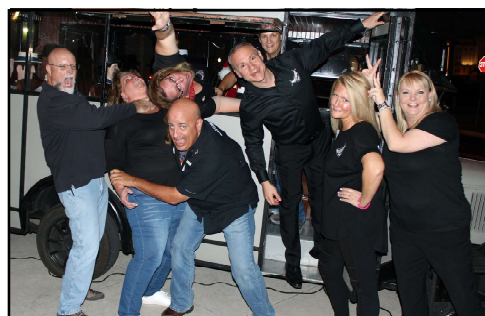
The cast had some fun posing outside the venue.