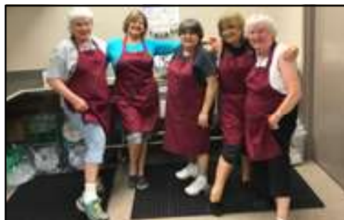
A hard-working group of volunteers, the kitchen crew, kept the food coming — and cleaned up — every night.