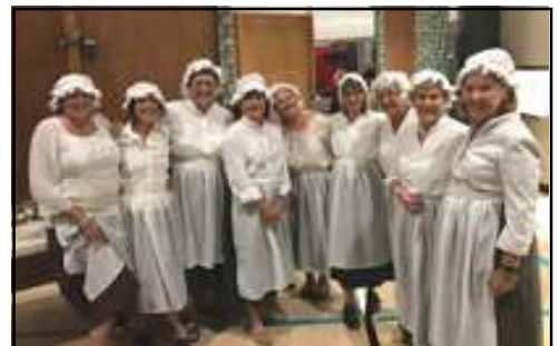
The volunteer "serving wenches" brought out food, drink and table decorations — and helped clean up — every night.