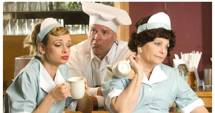
Scene from the three-character play Wally's Café as presented by the Colorado Stage Company.